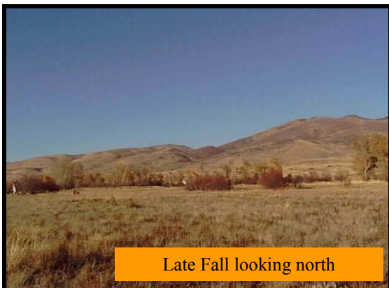
Late Fall looking north