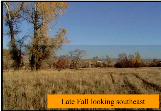
Late Fall looking southeast

If you are tired of the crowds and commercialization of Park City/Deer Valley, come and look at the wave of the future in Resort Areas. This valley is on the cutting edge for investment, a second home or a year around experience.